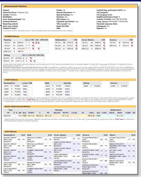
Figure 2. Student's testing history on multiple assessments.

CONTACT: For more information on national, state, and local assessments, contact State and National Assessment at 972-925-4432 and Local Assessment at 972-925-8940.